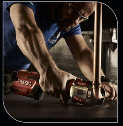
PRESS EVERYWHERE, ANYWHERE!